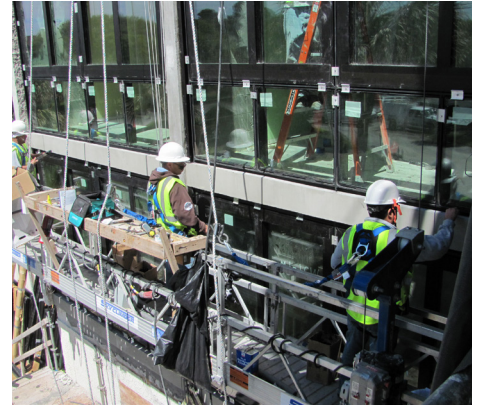
Curtainwall window installation