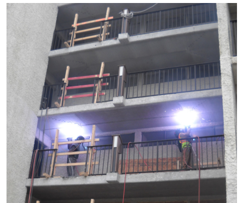
Thermal spray cathodic protection being applied to walkway hollow-core panels with contamination but limited distress