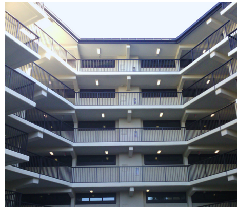
Finished courtyard elevation showing new beams, walkways, guardrails and windows

This project received a 2012 International Concrete Repair Institute ICRI Award of Merit for the work associated with the concrete restoration and preservation.