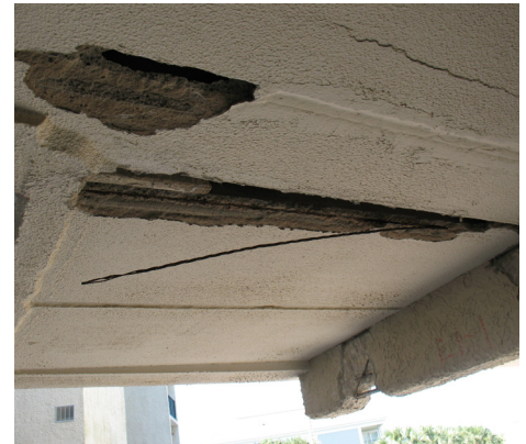
Corrosion distress at hollow-core panels

concrete haunches supporting ocean-side masonry walls with minimal outward distress were protected with thermal spray CP and a breathable aesthetic topcoat. CP monitoring stations were installed at representative locations. Ocean-front PHCP and land-side PHCP with increased oceanic wind exposure, contamination and distress, and associated cantilever beams were removed and replaced with a high-performance lightweight concrete mixture. The mixture was designed with weight similar to the replaced PHCP, and resistance to chloride ingress, cracking and other deterioration mechanisms. New slabs were keyed into the existing masonry walls or supported on cantilever beams on the ocean-side balconies, depending on existing configuration. The land-side walkway sections were cast integrally with replaced cantilever beams without control joints. Because some existing beams did not meet current live load requirements, supplemental reinforcing or pilasters were installed to increase capacity. Cathodic prevention point anodes were installed at interfaces to deter incipient corrosion. Most concrete and repair work was conducted in winter, requiring close attention to placement and curing. Slabs were sloped to promote drainage and components were coated.