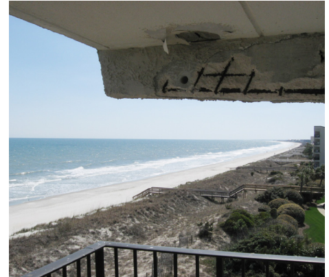
Corrosion distress at beam and hollow-core panel

Coastal structures have increased susceptibility to corrosion, concrete distress, leaks and safety hazards due to moisture and airborne salts from the ocean. Restoration projects at beach front condominiums can be complex, often necessitating intricate repairs and advanced preservation techniques for meaningfully extending the life of the building. These projects typically require specialty engineers and contractors for addressing materials distress; concrete contamination with ongoing corrosion activity; deficient or deteriorated fenestration and cladding; waterproofing and specialty structural issues (including guardrails, wall systems, deficient original construction and corrosion). They also generally require completion within compressed off-rental season time frames or while the building remains open and accessible to tenants.