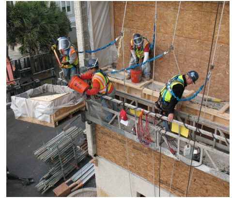
Slab edge replacement prior to window installation

A pragmatic approach was used to cost-effectively replace and preserve portions of the structure to extend the service-life of a coastal condominium. This included concrete replacement at locations with extensive and complex repairs and protection of other members where warranted. A high-performance concrete mixture was used to provide a viable solution to replacement of PHCP. Galvanic protection was used to protect areas of the structure with limited distress. Curbs at thresholds were installed to prevent water from entering units and windows, doors and handrails beyond their service-life were replaced. Protective coatings were installed to further extend the life of the structure and provide a clean, aesthetically pleasing look.