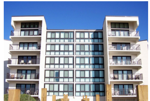
Finished oceanfront elevation showing new balconies, guardrails, windows and doors