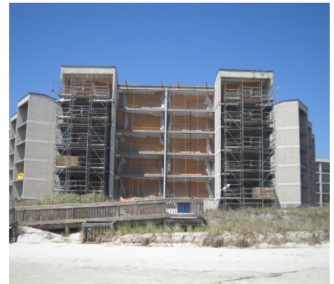
Oceanfront elevation showing balconies with demising walls and scaffolding - scope area included flanking balconies