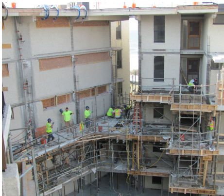
Courtyard window and concrete replacement in progress at area of heightened distress